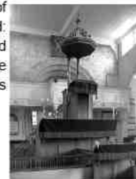
The imposing pulpit at St Mary's Whitby

The word 'pulpit' means a platform or raised area to address the gathered family of God. As we look on in the pews, it stands often on our left. But God looks at us from the east end of the church and the pulpit stands at his right hand: a sign that the sermon can be the divinely inspired message of prophet and teacher, and so become living and active in the minds and hearts of its hearers.