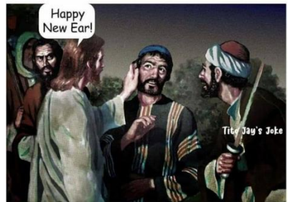
Luke 22:51 (sort of)